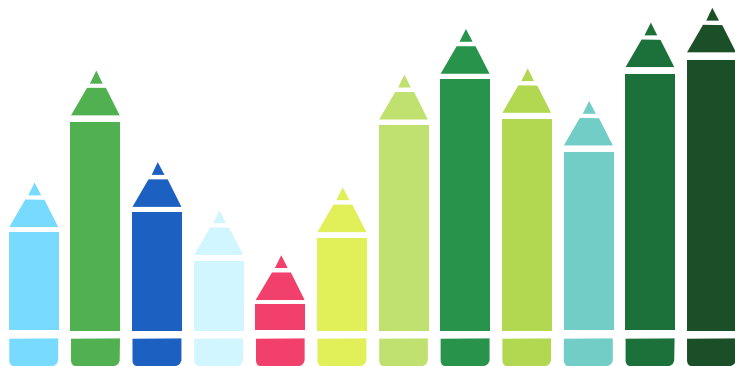
Extensive Academics / Student Performance Analysis

"Mobile Apps" is crafted with lot of concentration on what parents can expect or what they may look for. Parents who have no time to visit the school but are very much concerned about their child's studies would also love to get through the details at a few clicks. Logging into their account, parents can view reports on attendance of their child, performance at studies or in co-curricular activities etc.